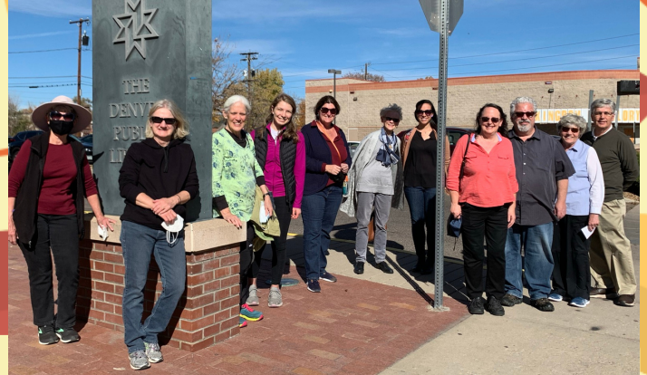
Racial Healing group participants learning at an evening with Dr. Carlotta Walls Lanier (left), and at the Five Points neighborhood walk (right).